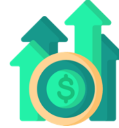
Retail Margins on Lab services