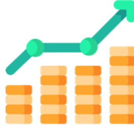
Retail Margins on Device Sales